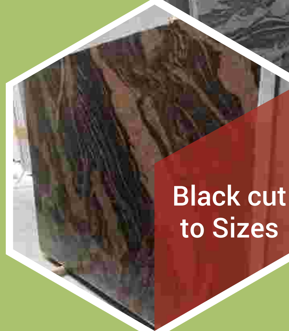
Black cut to Sizes