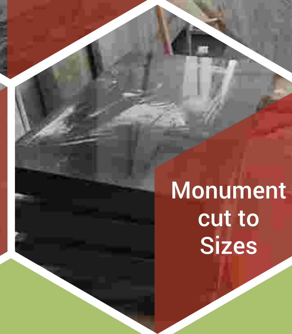
Monument cut to Sizes